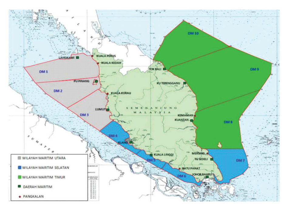
Figure 1 Maritime Zone of West Malaysia